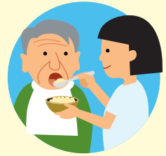
Personal care (e.g. feeding, bathing, etc)