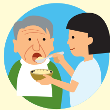
Personal care (e.g. feeding, bathing, etc)