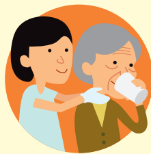
Speech therapy service