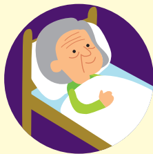
Residential respite service