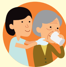
Speech therapy service