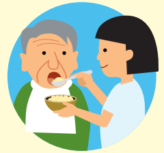
Personal care (e.g. feeding, bathing, etc)