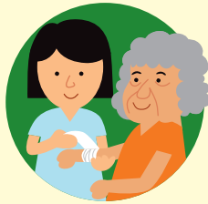
Nursing care (e.g. blood pressure monitoring, wound management, etc)