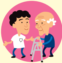
Rehabilitation exercise (e.g. physiotherapy, occupational therapy, etc)

The services are similar to those of the existing subsidised Day Care Centre for the Elderly and Enhanced Home and Community Care Services. The services include rehabilitation exercise, nursing care and personal care, etc. Some RSPs also provide residential respite service and / or speech therapy service.